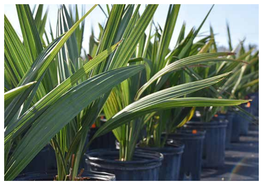
Dsbal Minor grown in containers