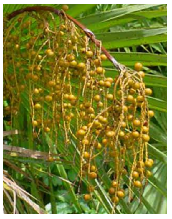
Female Paurotis Palm Fruit