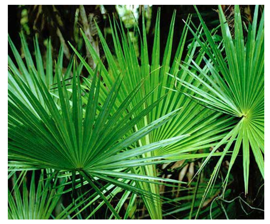
Paurotis Palm leaves