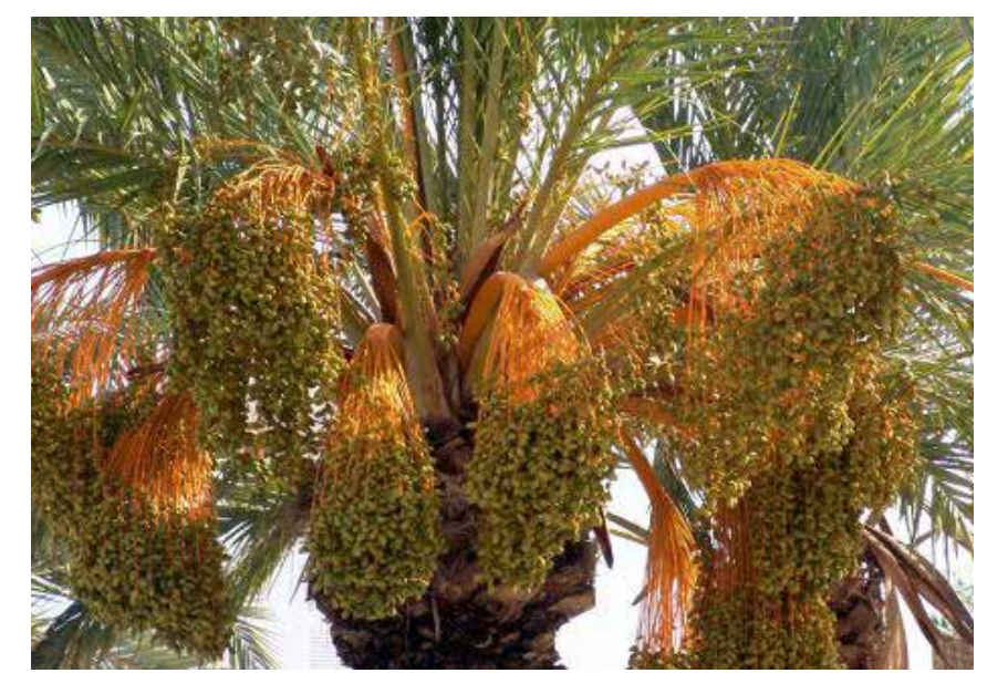
Field grown Queen Palm

The Queen Palm is a palm of many names. It was known for many years as Cocos plumosa. Then in 1916, the genus of Cocos was broken up into seven groups, this is where it got its name Arescastrum romanofzianna. Later on, the species changed to its present name, Syagrus romanzoffiana.