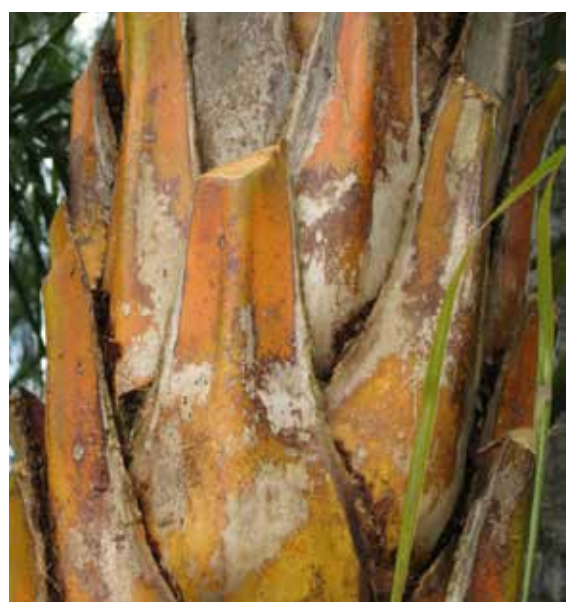
Reclinata Palm trunk