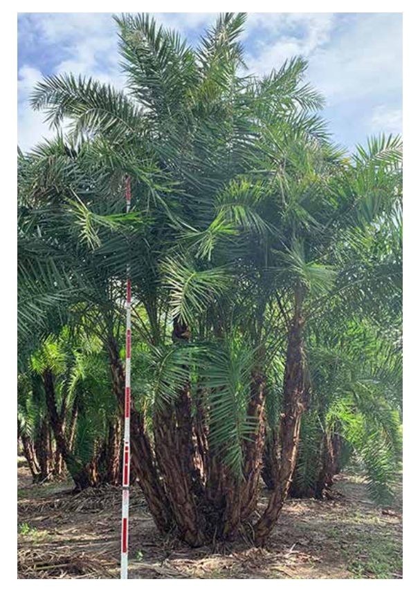
Field grown Reclinata Palm

Native of Senegal, a country in the northeastern part of sub-Saharan Africa, Reclinata is a beautiful and fairly unsual palm that grow in huge clumps and can make an impressive statement in the landscape. Reclinatas work well in landscapes when they are planted in the open and have room to stretch in all directions. They are used as a specimen centerpiece or as a dense landscape buffer.