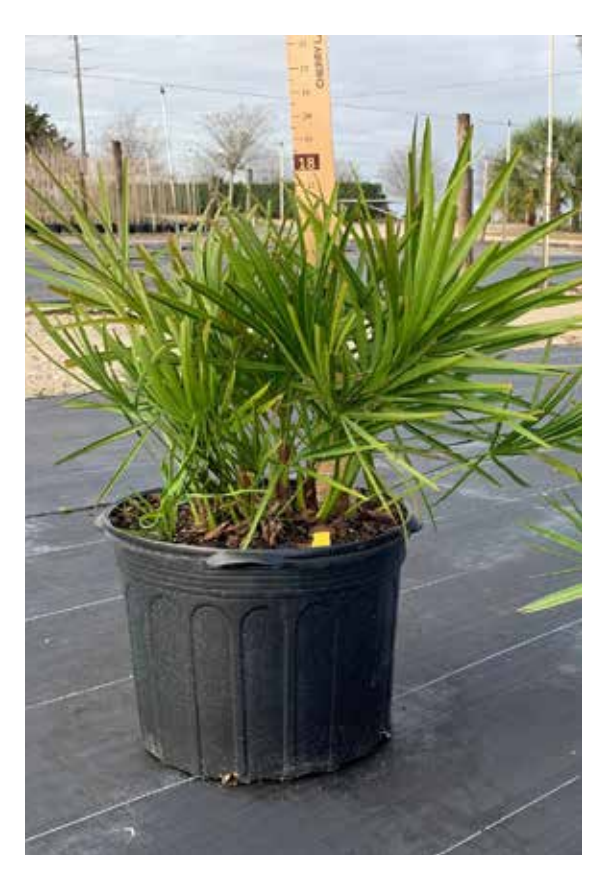
Container grown Saw Palmetto 'Green'

The Saw Palmetto 'Green' is known for growing wild in Florida's natural landscape; however, it is also a common plant for home landscapes throughout the state as well. It tolerates a range of conditions, and it is a fantastic provider of texture beneath trees, or as a filler, hedge, backdrop, or accent. It's high salt tolerance makes it the perfect plant for coastal gardening.