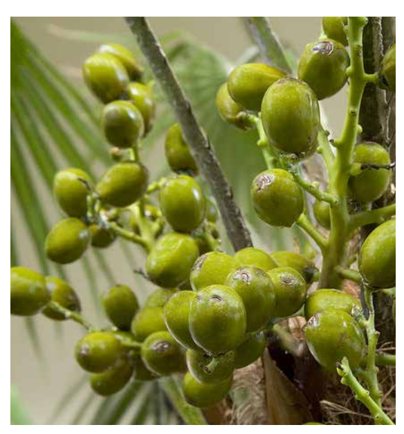
Saw Palmetto 'Green' berries