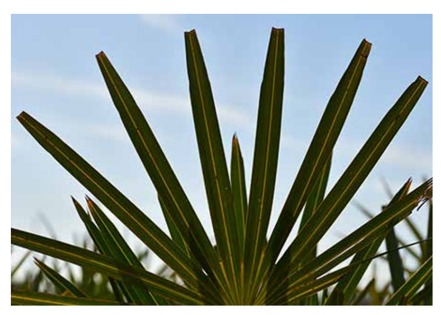
Saw Palmetto 'Green' leaves

The Saw Palmetto 'Green' is practically maintenance free. It does not require cold protection, and they have adapted well to Florida's sandy soils. Once mature, it is highly drought tolerant as well. The Saw Palmetto 'Green' can be planted next to any structure including houses, walls, a fence, and even against a tree trunk. They also make fantastic container plants for larger sized pots or planter boxes, and they can even be planted indoors.