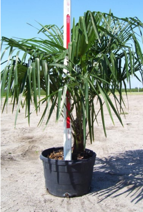
Container grown Windmill Palm

The Windmill Palm is an attractive palm which sports a compact crown with large, fan-like, green foliage. It has distinctive, hairy, black fibers covering its slender trunk. The Windmill Palm is ideal for small gardens as it does not branch, making it fit into small spaces, side-yards, and rock gardens. If multiples are planted close together, the Windmill Palm creates a cluster or grove in tropical garden schemes. It is the perfect plant for swimming pool enclosures, and it can be grown either indoors or outdoors. Windmill Palms are regularly seen grown in pots and planters.