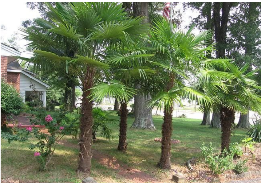
Windmill Palm in the landscape

The Windmill Palm's leaf shafts produce fibers which cover the trunk. They can be made into ropes, mats, brushes, brooms, and hats.