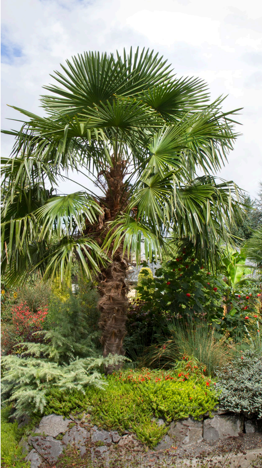
Windmill Palm in the landscape