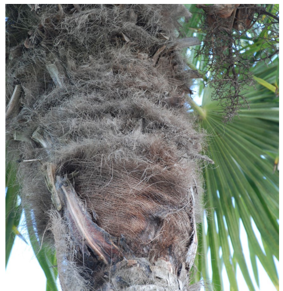
Windmill Palm trunk