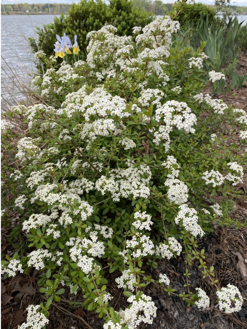
Viburnum obovatum in a landscape