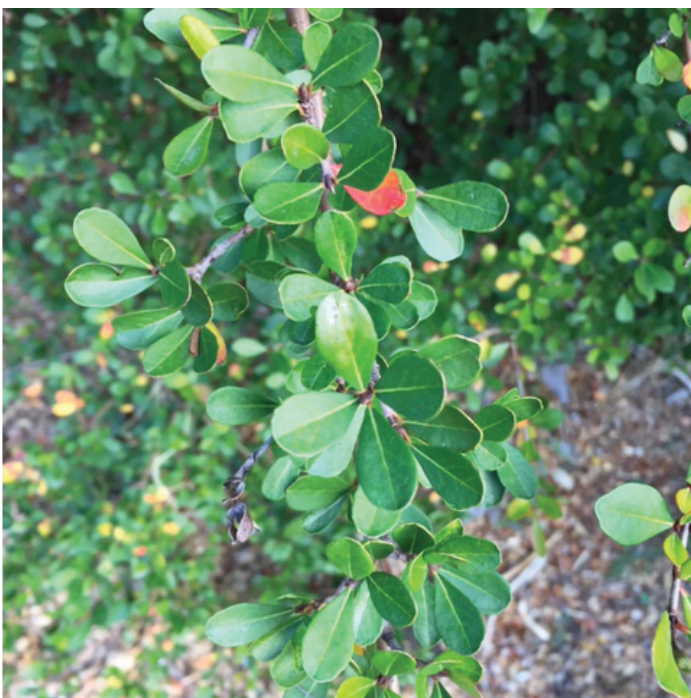
Viburnum obovatum leaves

In landscaping, Walter's Viburnum shines in several roles. Its dense growth and evergreen foliage make it an excellent choice for hedges, screens, or borders, providing both aesthetic and functional benefits. Moreover, its fragrant spring blossoms and berry production contribute to wildlife gardens, attracting birds and other wildlife species. With relatively low maintenance requirements and its capacity to adapt to different soil conditions, Viburnum obovatum is a favored addition to both residential and commercial landscapes in the southeastern United States, enriching outdoor spaces with its beauty and ecological significance.