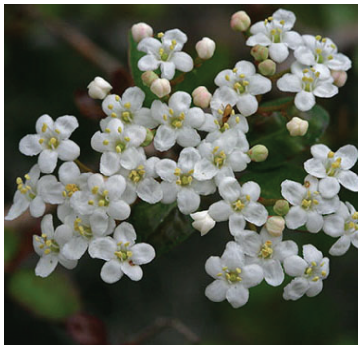
Viburnum obovatum flowers