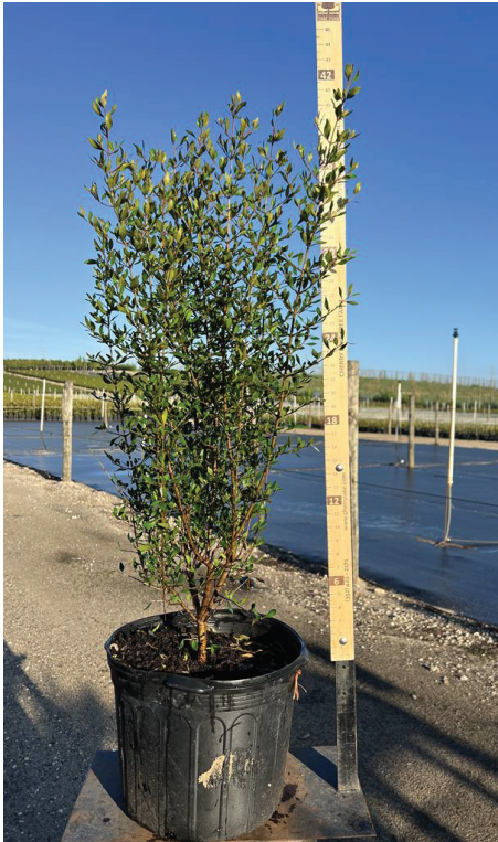
Viburnum obovatum on the farm

The most striking feature that separates this selection from other Walter's Viburnums is its unique, dark green foliage that is stunning at first glance. The large shrub or small tree at maturity reaches 10-12' in height and spreads 6-10'. In the landscape the 'Withlacochee' stays uniform in its growth habit and does not get "leggy" as many of the Viburnum species do, requiring less pruning and maintenance. It also exhibits a showy white bloom in the spring and maroon foliage during the winter months in response to cold weather. Separating itself from other Walter's Viburnum species that are semi-deciduous, the 'Withlacochee' tends to hold more of its leaves in the winter and keeps a very full appearance.