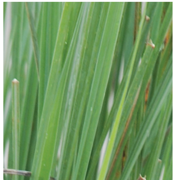
Dwarf Fakahatchee Grass leaves