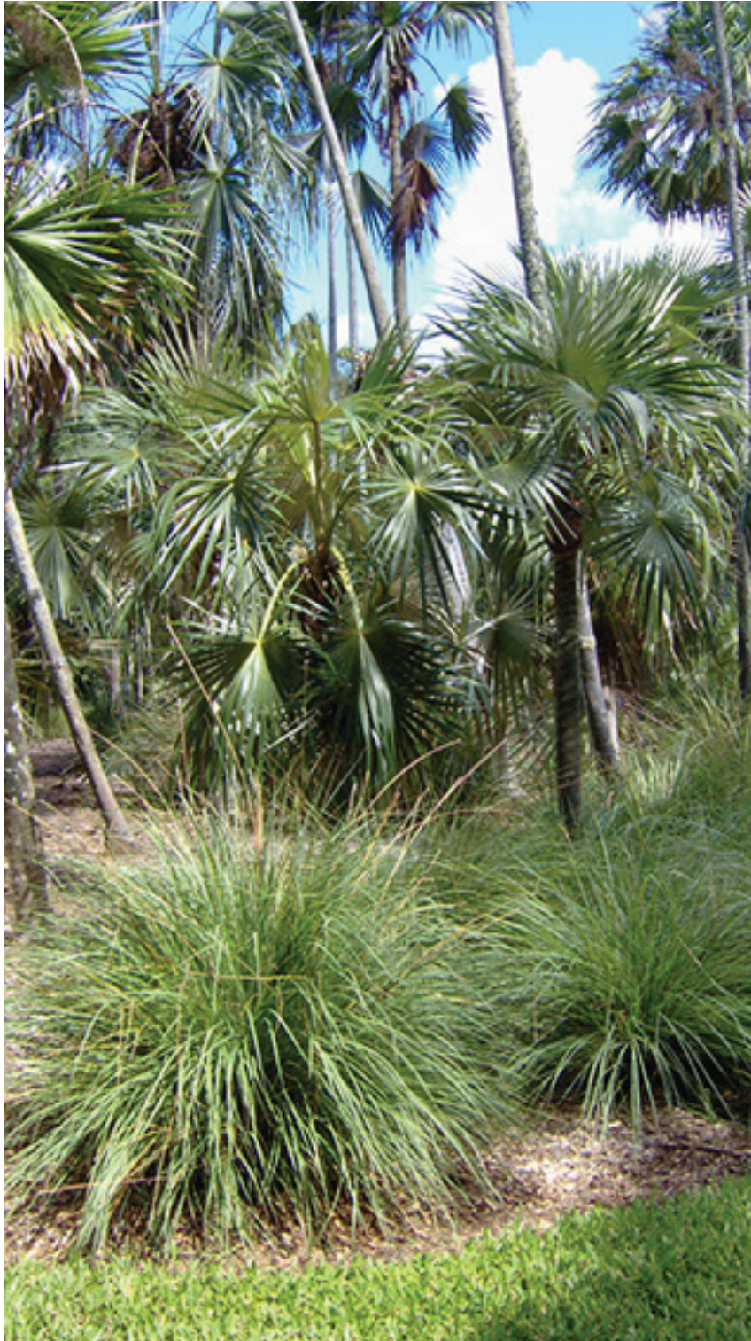
Dwarf Fakahatchee Grass in the landscape