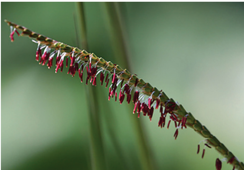
Dwarf Fakahatchee Grass flowers

Dwarf Fakahatchee Grass works great as an accent in ground cover beds, a stabilizer for banks and steep slopes and a nice edging along streams and ponds. Dwarf Fakahatchee Grass is a very functional plant, yet it is not being used as much as other varieties. In fact, it is considered a threatened species in Florida by the Endangered Plant Advisory Council.