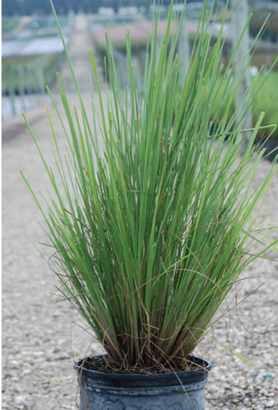
Dwarf Fakahatchee Grass potted

Dwarf Fakahatchee Grass, or commonly known as Florida Gamagrass, is a smaller relative of Fakahatchee Grass ( Tripacum dactyloides ). This Florida native grass is easy to grow and low maintenance which makes it a great addition to many landscapes. It acclimates to both dense and light soils and is one of the most shade tolerant grasses, growing best in full sun or light shade. Another great feature is its tolerance to both wet soil conditions and droughts.