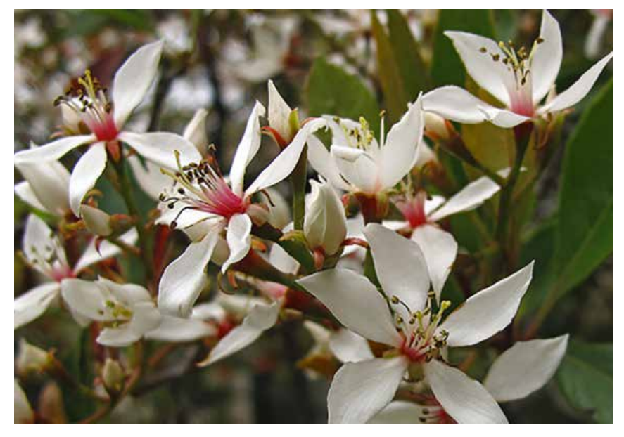
Indian Hawthorn flowers

The leaves are dark green, slightly rounded in shape and leathery in texture. During the fall and winter, some of the older leaves will turn a crimson red color before falling off the plant.