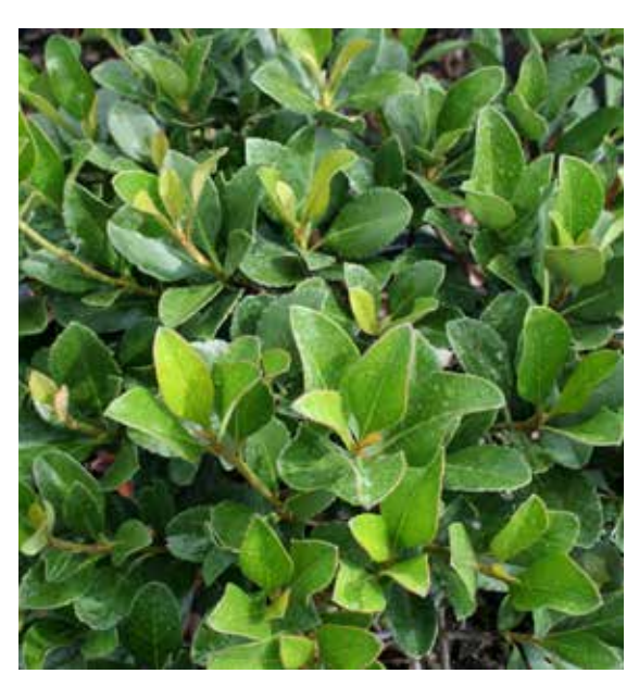
Indian Hawthorn leaves