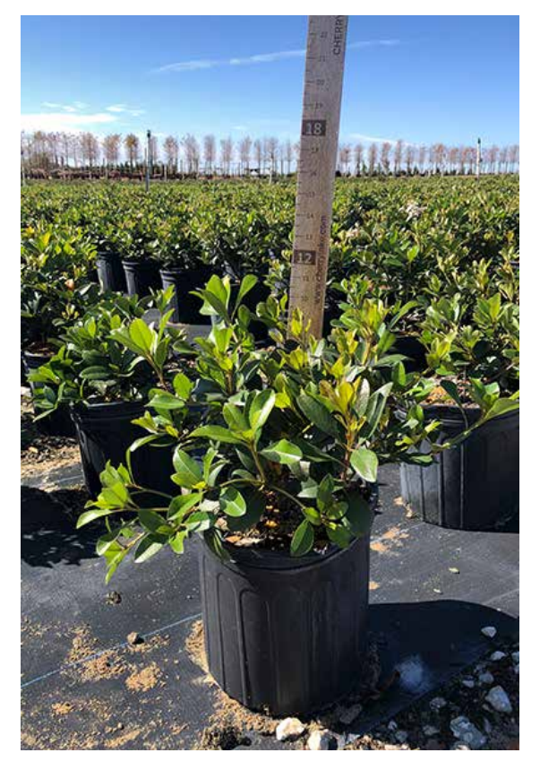
Indian Hawthorn potted

Indian Hawthorn is a small to medium shrub that is grown throughout Florida and the coastal areas of Georgia and the Carolinas. This evergreen shrub grows to a mature height of five feet tall by five feet wide.