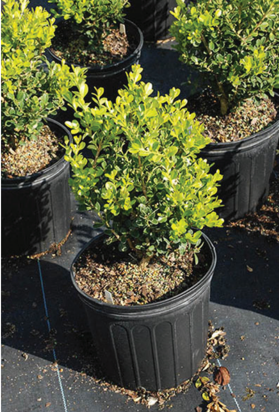
3g Japanese Boxwood

Members of the Buxus family, Japanese Boxwoods are densely packed shrubs native to Asia. This evergreen shrub's thick foliage makes them an exceptional choice for ornamental hedges as they are easily shaped to fit the needs of the finished project. In fact, Boxwoods were named the most popular shrub in America.