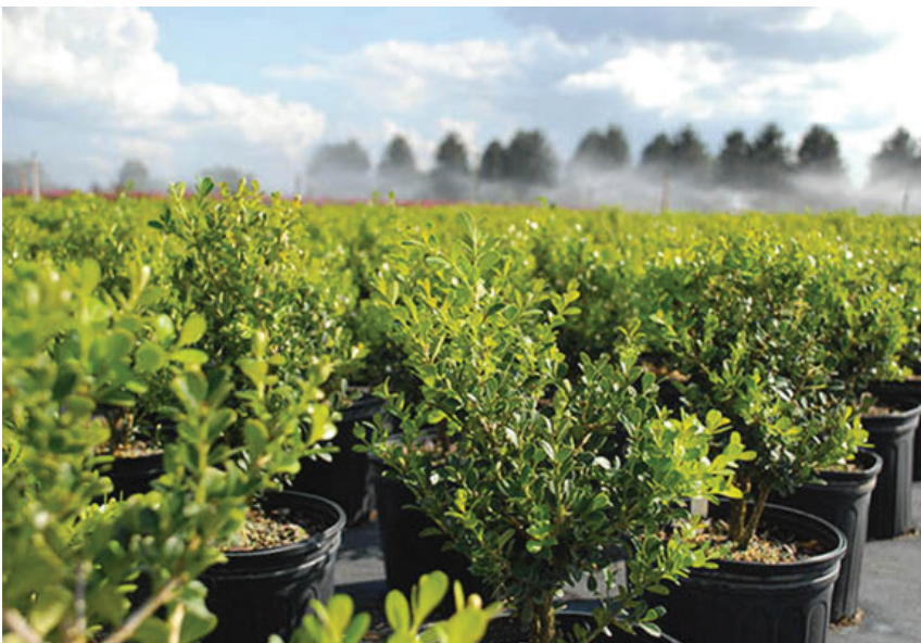
Japanese Boxwood- old growth (dark green) and new growth (light green)

Japanese Boxwood produces delicate white flowers that are not showy. The fruit of the Boxwood shrub is dark and inconspicuous. Japanese Boxwoods make great accent plantings, foundation plantings and even topiaries.