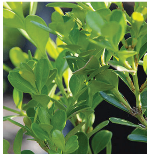
Japanese Boxwood leaves