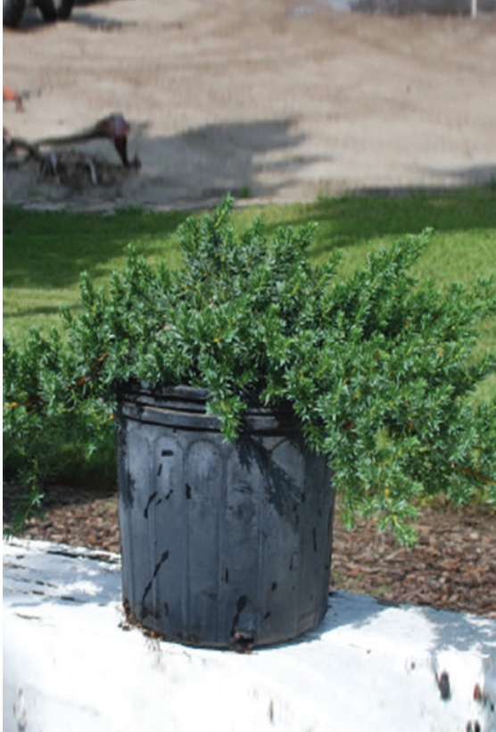
Juniper Blue Pacific potted

Juniper Blue Pacific is a low-growing, trailing groundcover that has become a favorite of many due to its more compact habit and superior foliage. It sports beautiful ocean blue-green needles that keep their color very well in colder weather.