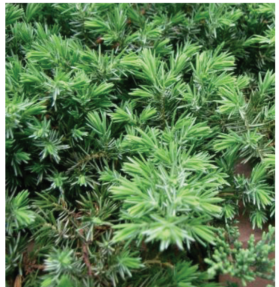
Juniper Blue Pacific needles