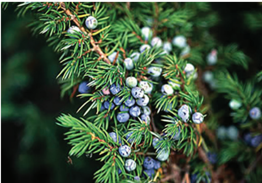
Juniper Blue Pacific berries

The Blue Pacific cultivar, is gaining popularity among Junipers. It is noted for having better blue foliage color, better ground cover form, more dense foliage along the branches and a better resistance to winter injury. It's ability to spread and cascade down walls and pots make it a very interesting element in landscapes.