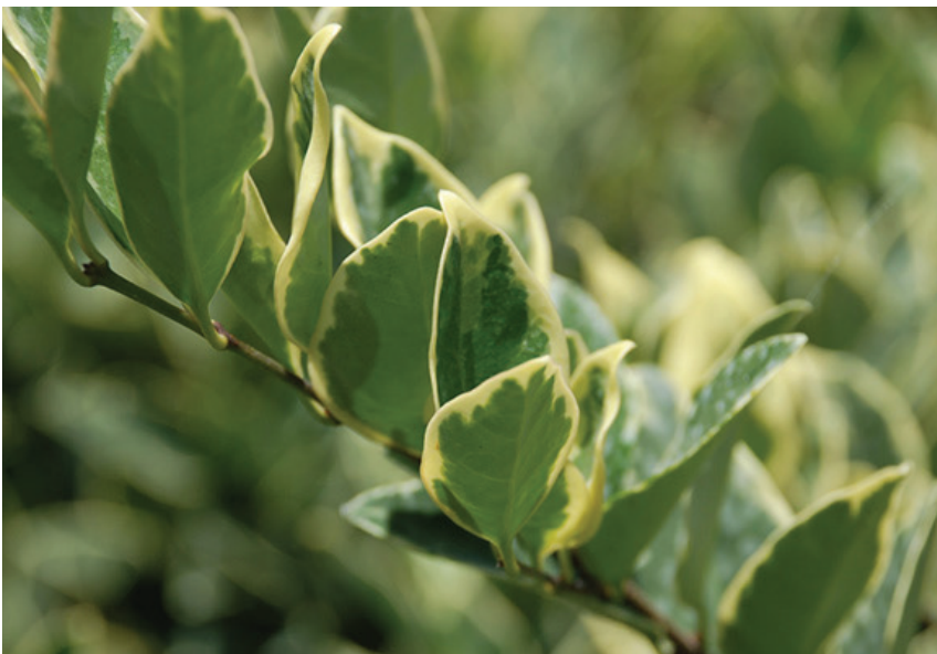
Ligustrum Jack Frost leaves

To keep this woody evergreen happy, make sure it's exposed to full sun or partial shade. Keep it in well-drained soil and water regularly; more during times of extreme heat or drought. Pruning is recommended 2-3 times per year to maintain desired shape.