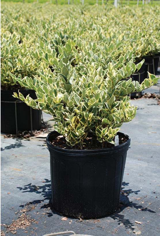
Ligustrum Jack Frost potted

Ligustrum 'Jack Frost' is famously characterized for its two-tone foliage. Its waxy leaves are dark green with irregular ivory markings that run along its edges, which provide excellent contrast to any landscape. In late spring and early summer, it puts out clusters of small, white flowers very similar to those of its ancestor, the Japanese Privet. Following the spring bloom, berries persist through the summer and attract birds. It is disease resistant and grows well in a wide variety of soil types and climates.