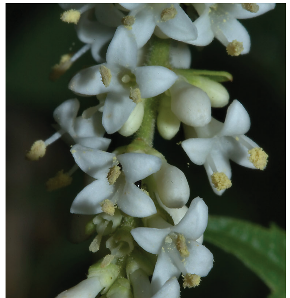
Ligustrum Jack Frost flowers