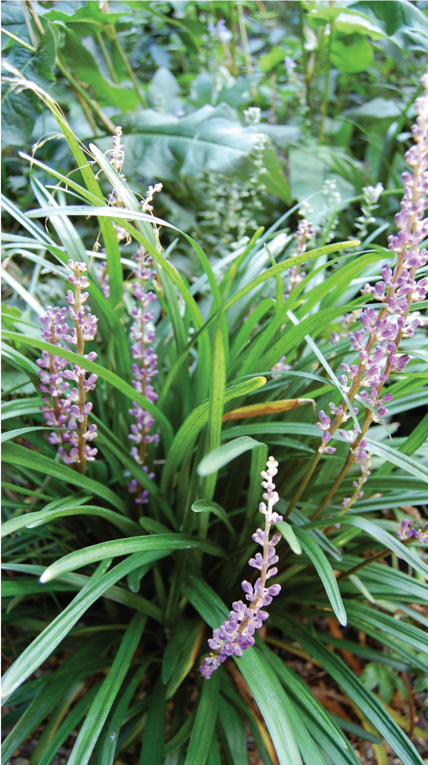
Liriope Super Blue in the landscape