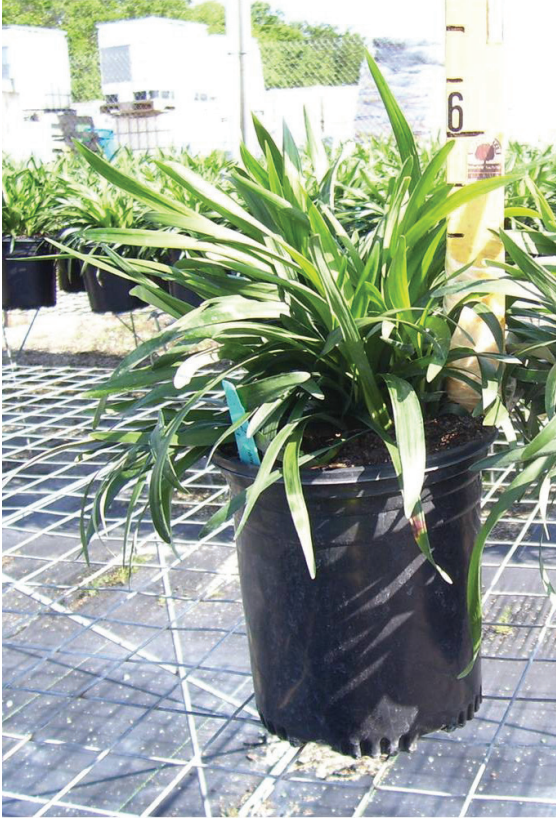
Liriope Super Blue potted

Super Blue Liriope is a small, clumping ground cover with delicate violet flowers. From Summer to early Fall, these flowers bloom in cone-shaped bunches at the end of tall green stems. Super Blue is noted for having showiest blooms of the Liriope family. As the autumn chill settles in, these flowers are replaced by glossy purple-black fruits.