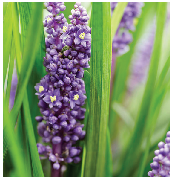
Liriope Super Blue flowers