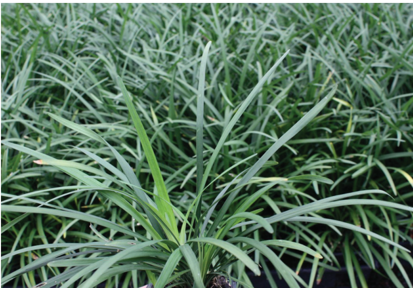
Liriope Super Blue leaves

Not to be confused with "Big Blue" Liriope, Super Blue has a more vigorous growth habit and can grow to be 20 inches tall. It is exceptional as a container plant, lush border or pathway edging, in mass plantings and under large trees. This hard-working shrub grows well in hard to grow places such as banks and slopes, driveways or filling in gaps between shrubs.