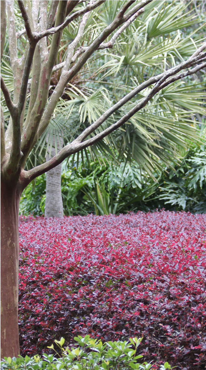
Loropetalum Plum in the landscape