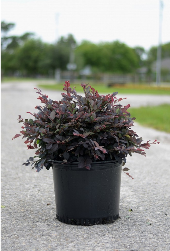
Loropetalum Plum potted

Loropetalum Plum or otherwise known as Plum Delight, is a great, midsized shrub. Distinctive plum colored foliage and pink fringy flowers make this shrub stand out. But what makes the Loropetalum a favorite of gardeners and landscape designers is not only its unique visual elements, but also that it is a tough plant with very little pests and it is easy to grow and maintain.