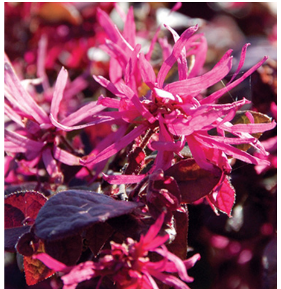
Loropetalum Plum flowers