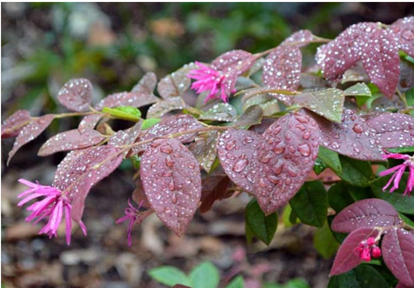
Loropetalum Plum leaves

For years, Ruby Loropetalum had been the Loropetalum cultivar of choice and was recognized as a fairly low maintenance landscape plant with very little insect or disease problems. However, recently, there have been increasing reports and complaints of unexplained decline on Ruby Loropetalum, especially in central Florida. The Plum cultivar has been a recommendation in place of the Ruby. Plum is less susceptible to leaf blight and also has a skinnier leaf, darker foliage and smaller, darker flowers.