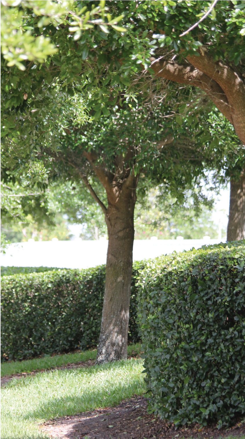
Viburnum Odoratissimum in the landscape