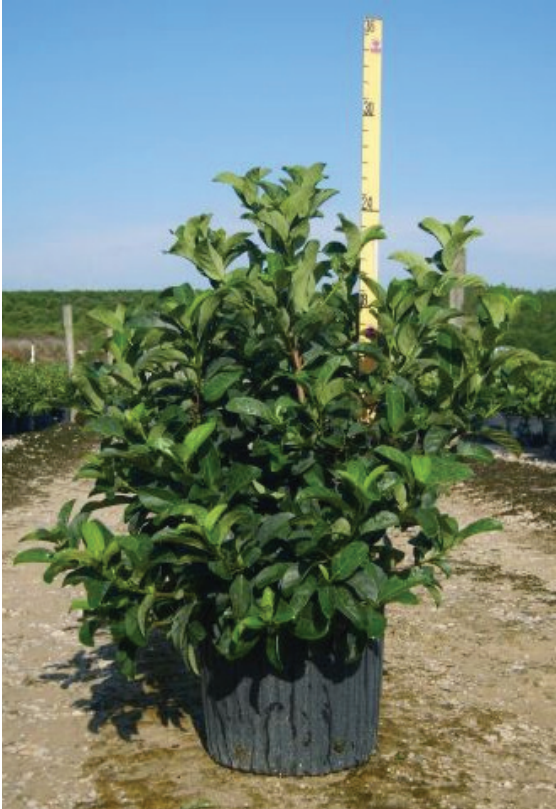
Viburnum Odoratissimum potted

Viburnum Odoratissimum is an evergreen shrub or small tree that can reach up to twenty feet tall and fifteen feet wide. It's glossy, bright green leaves are arranged in opposite directions on green stems in such a way that it gives the impression of being quite robust and dense. Fragrant, white flowers appear in spring and cover the plant. Then in the fall, Viburnum Odoratissimum will sprout moderately showy, small red berries that turn black when ripe. Mature Viburnums are more likely to fruit.