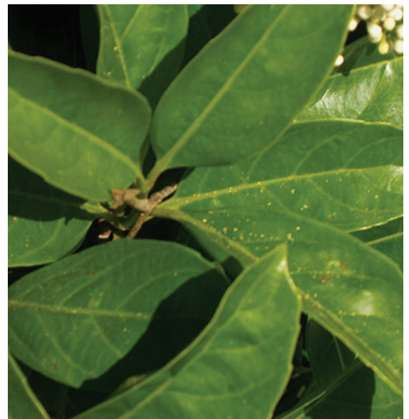
Viburnum Odoratissimum leaves