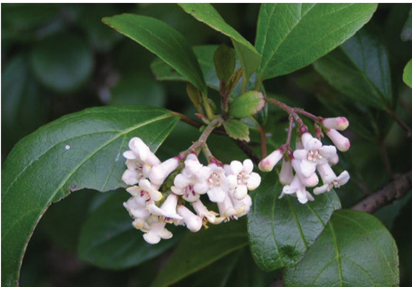
Viburnum Odoratissimum flower

A very gratifying shrub to use as a hedge, Viburnum Odoratissimum works great because of its fast rate of growth and the sweet springtime fragrance. It is versatile and rarely bothered by pests or disease. Although mostly used for hedges, Viburnum Odoratissimum can also be planted alone as a specimen tree; if left alone it will become an attractive tree that looks great for small or formal settings.