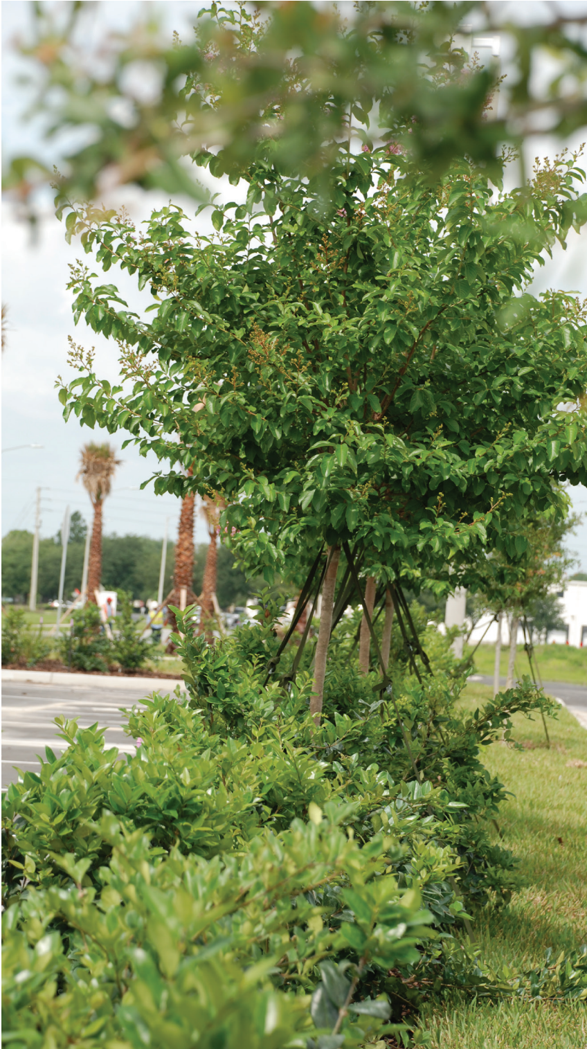
Ligustrum in the landscape