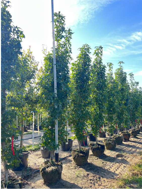
Slender Silhouette on the farm

Slender Silhouette Sweetgum is a captivating cultivar of the American Sweetgum tree, prized for its distinctive growth habit and stunning seasonal transformations. It is native to the southeastern United States, and can be found in northwestern and central Mexico, Guatemala, Belize, Salvador, Honduras and Nicaragua. This tree is celebrated for its tall, narrow, and columnar form, which sets it apart from its broader-growing relatives. During the growing season, its foliage is a deep green, serving as an elegant backdrop. However, the real spectacle comes in the fall when its star-shaped leaves transition into a breathtaking array of orange, red, and purple hues, making it a standout feature in any landscape.