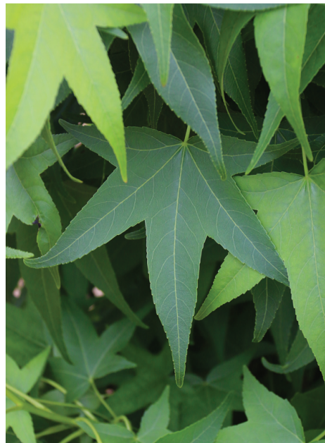
Slender Silhouette leaves