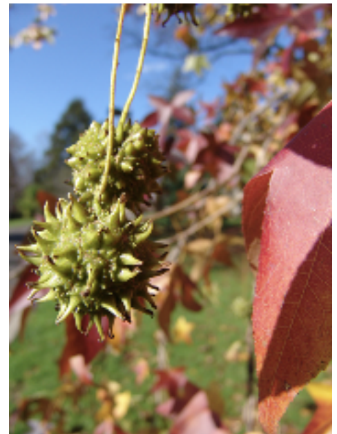
Slender Silhouette fruit capsules