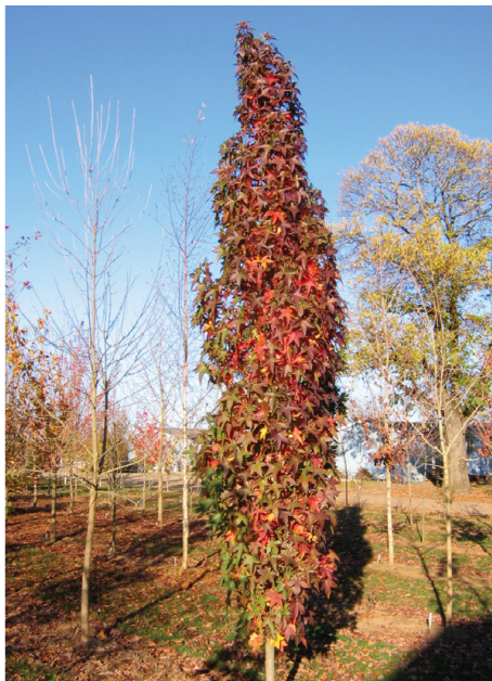
Slender Silhouette in the fall

Pruning for the Slender Silhouette Sweetgum is typically minimal, primarily aimed at removing any dead or damaged branches. Ensuring adequate watering during its establishment phase helps promote healthy growth. One consideration is that the tree produces distinctive spiky fruit capsules, often called "gumballs," which can be somewhat messy and may require regular cleanup. The Slender Silhouette Sweetgum's unique growth habit and stunning fall foliage make it a sought-after choice for those looking to add height and beauty to their outdoor spaces.