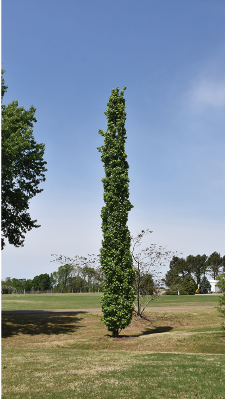
Slender Silhouette in a landscape