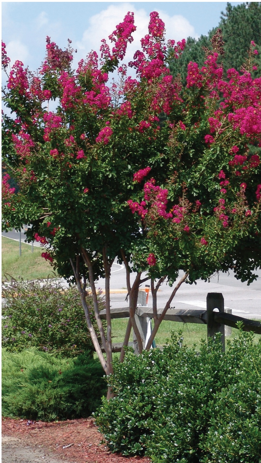
Tuscarora Crape Myrtle in the landscape

lagerstroemia (indica x fauriei) 'Tuscarora'