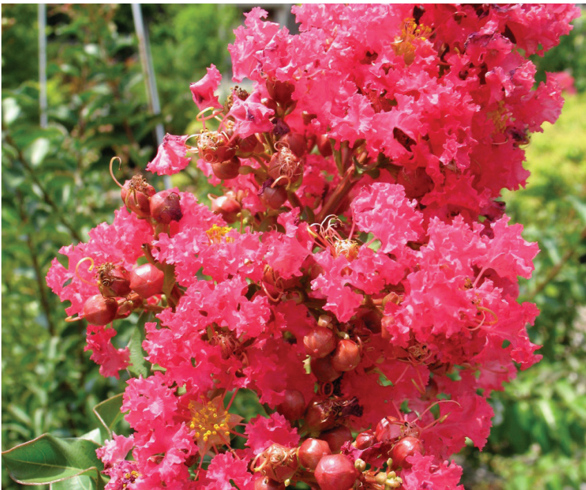
Tuscarora Crape Myrtle flower

An Indian Series crape myrtle, the size of Tuscarora is normally 25% to 33% smaller than its family members 'Natchez' and 'Muskogee' of the United States Department of Agriculture National Arboretum. Where space is limited, this upright vase shaped small tree with light brown exfoliating bark could be a better choice. If stunning floral display is the number one criteria, Tuscarora will most likely be your pick.