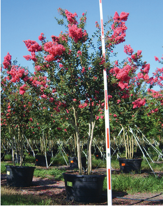
Tuscarora Crape Myrtle potted

lagerstroemia (indica x fauriei) 'Tuscarora'