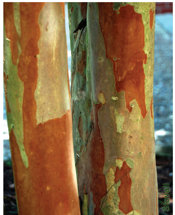
Tuskegee Crape Myrtle bark