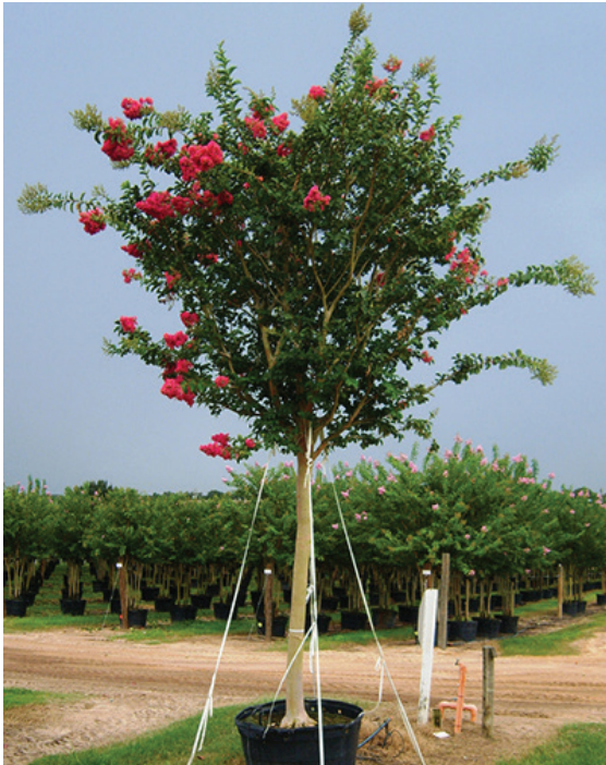
Tuskegee Crape Myrtle potted

lagerstroemia (indica x fauriei) 'Tuskegee'