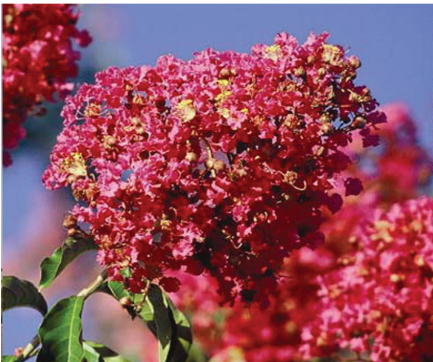
Tuskegee Crape Myrtle flower

Grown as a single trunk, Tuskegee will have the largest trunk caliper size of all the USDA National Arboretum selections.