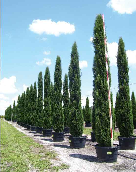
15g Italian Cypress

Italian Cypress is an evergreen conifer that is native to Southern Europe and western Asia. It has a narrow columnar habit of growth and forms tall, dark green columns 15 to 50 feet in height.