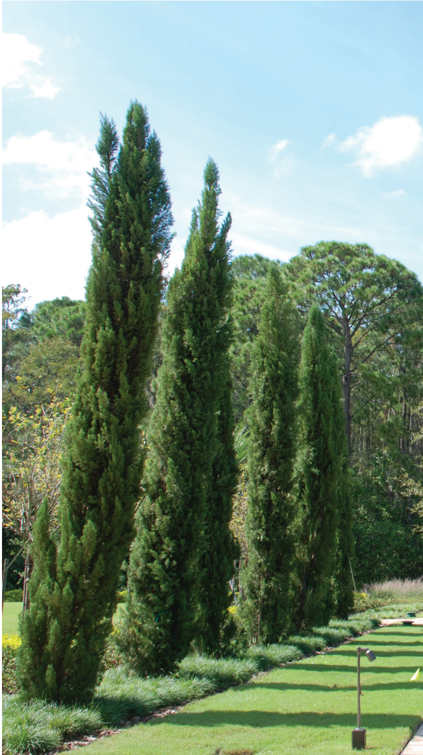
Italian Cypress in the landscape

Common Names: Bald Italian cypress, Tuscan Cypress, Graveyard Cypress or Pencil Pine.