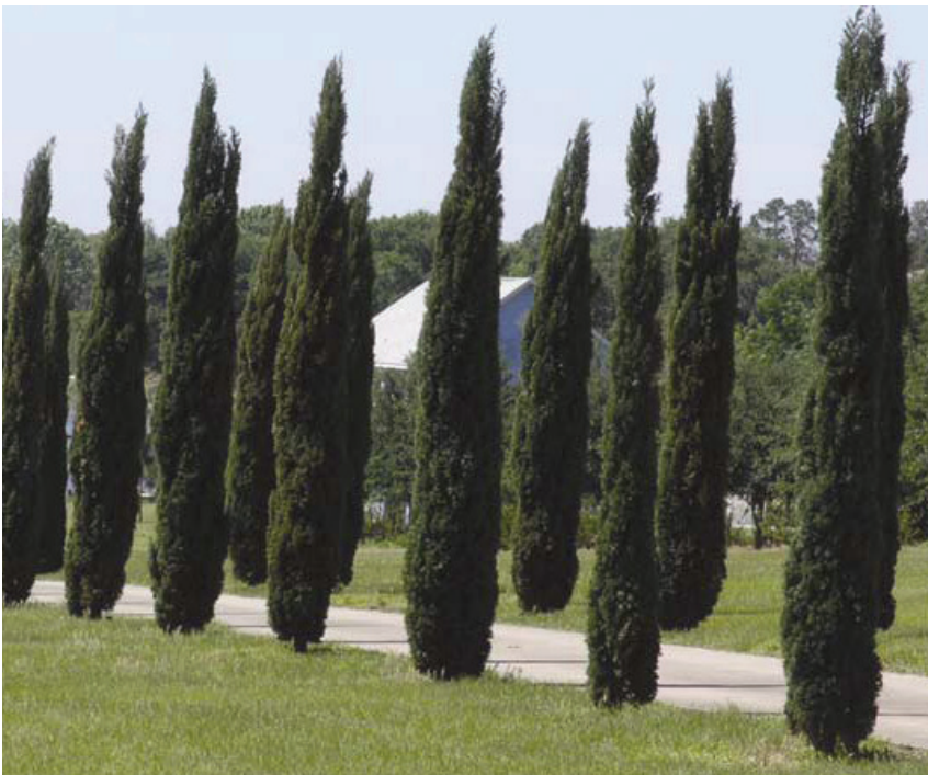
Italian Cypress foliage

The Italian Cypress is a great choice when it is desired to draw attention to a formal area. With its fine textured genuine rich green foliage, narrow columnar habit and tall mature height, Italian Cypress excels beyond other choices.