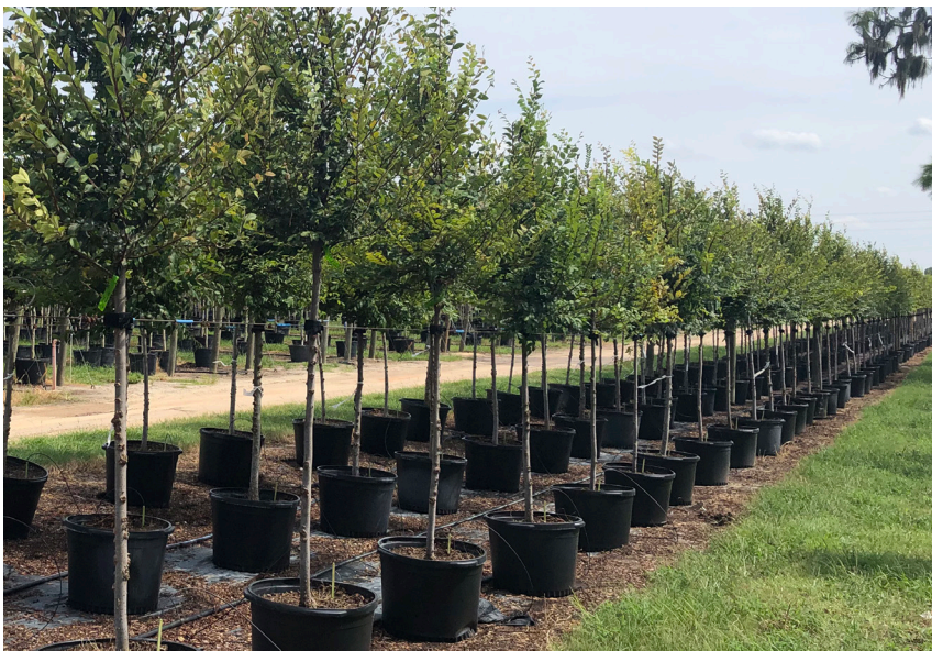
Container grown Elm Winged

Because the Winged Elm grows in multiple types of climates, its mature size is dependent on its environment. The Winged Elm is adaptable, and can grow in any soil rather quickly. In order for the Winged Elm to remain sturdy, it must be pruned regularly at an early age to minimize double or multiple trunks from forming. While a native elm to the Southeastern United States, Winged Elms can be found in various places, because their need for maintenance is minimal, adapting to poor drainage, and partial shade. The Winged Elm can even tolerate air pollution. This tolerance makes these trees ideal for big cities, parking lots, strip malls, and residential neighborhoods.