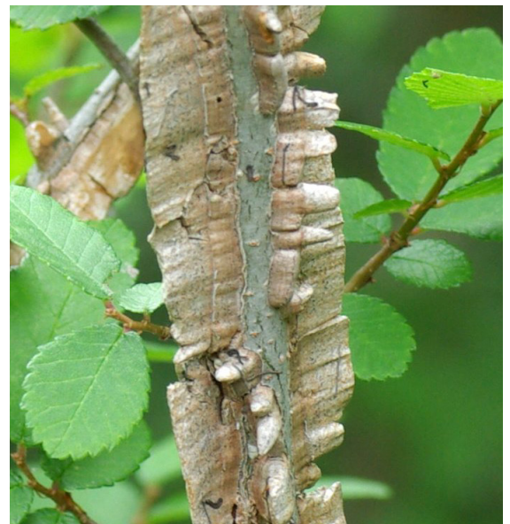
Elm Winged bark