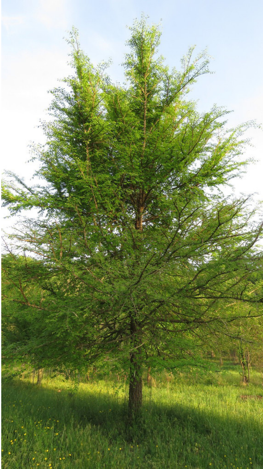
Winged Elm in the landscape