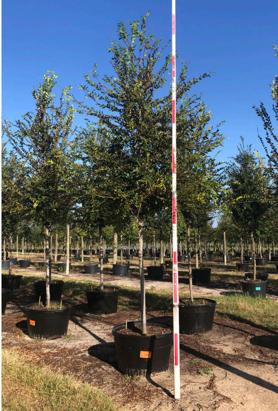
Container grown Elm Winged

The Ulmus alata , commonly referred to as the Winged Elm, is considered unique because of its bark's very broad, thin pair of "corky wings." "Corky" generally starts to appear on Winged Elms after 1-2 years of age when grown from a seed; however, when cutting grown winged elms, "corky" can appear at the liner stage. The wood of a Winged Elm is very flexible and springy; however, it is also hard and resists splitting.