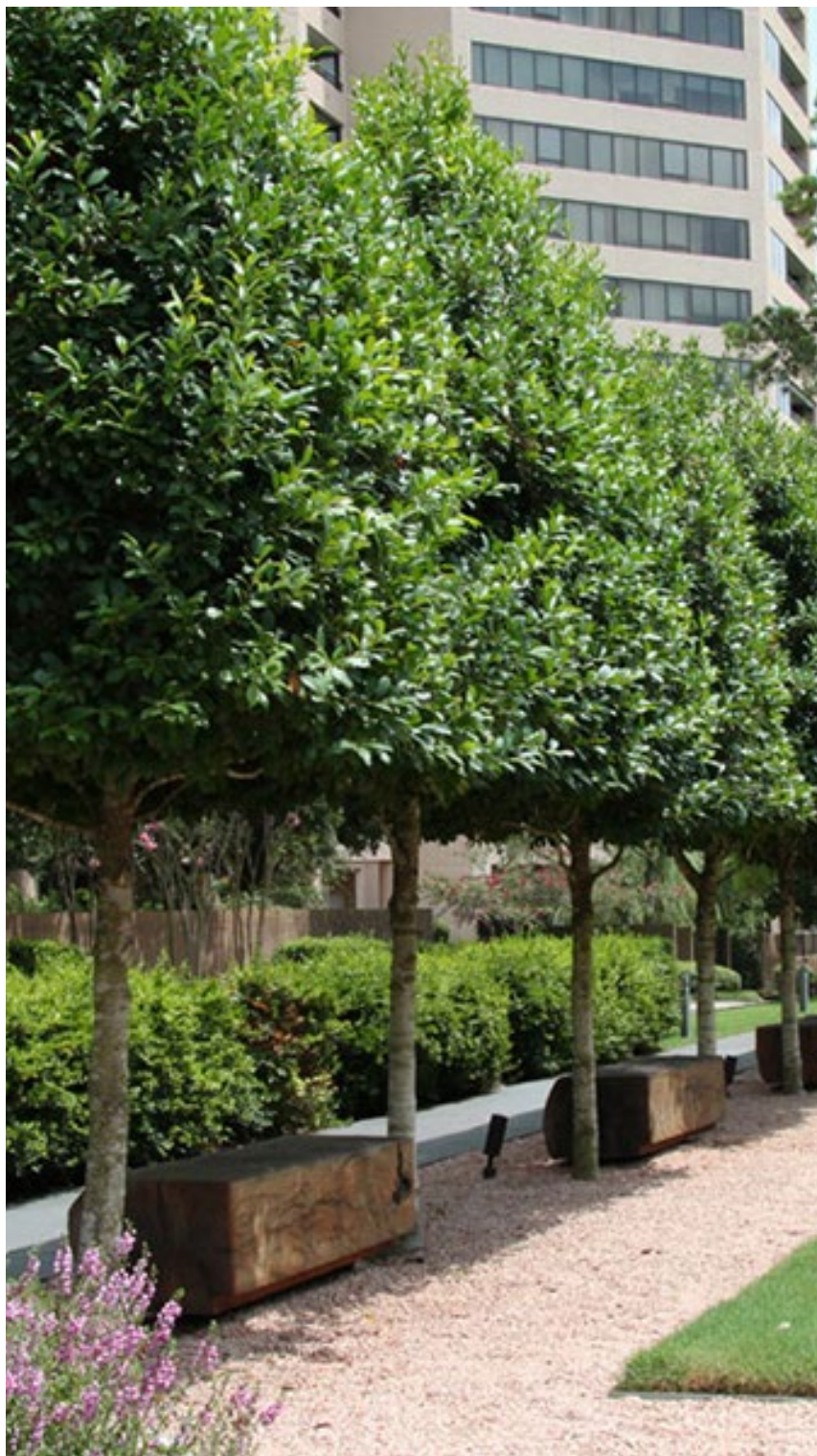
Holly Eagleston in the landscape