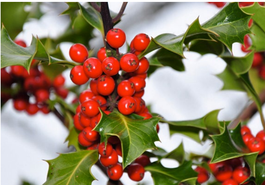
Holly Eagleston berries

Eaglestons are stunning ornamental trees that thrive in zones 6 to 9. Eagleston Hollies range between 20-25 feet when mature with a spread of 10-20 feet. Their slow growth rate allows for them to be kept in their natural, pyramidal shape with minimal upkeep or to be shaped to fit the finished project's design plan.