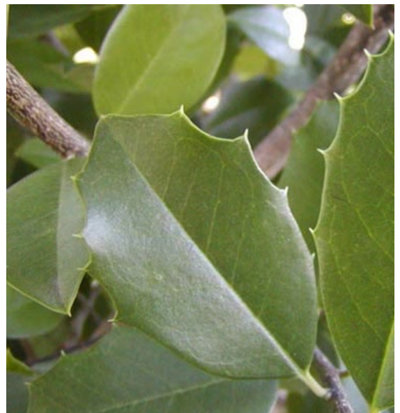
Holly Eagleston leaves