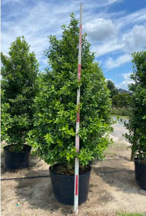
Holly Eagleston potted

The Ilex x attenuata 'Eagleston' is a natural hybrid of the Dahoon Holly and American Holly. The Eagleston Holly is a beautiful evergreen holly that is grown as a large shrub or small tree with a pyramidal growth habit. The tree has a dense canopy with small slender branches which are smooth and light to medium gray in color. During the cooler months, it produces an abundance of bright red, fleshy, round berries.