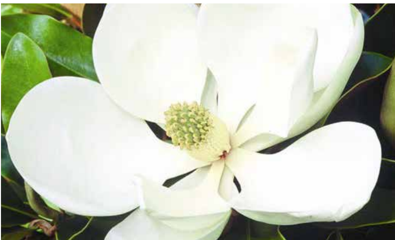
Blanchard Southern Magnolia flower

The tree's structure is usually central leader dominant with well-spaced major branching that yields a loose pyramidal form. The growth habit is adaptable to be grown full to the ground, or with a clear trunk when visibility is desired.