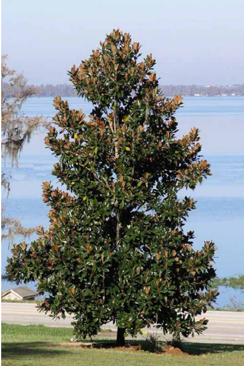
Blanchard Magnolia in the landscape