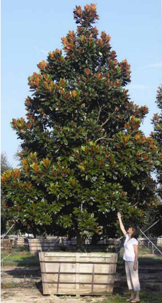
Blanchard Southern Magnolia grown in container

Dressed with dynamic foliage that illuminates the landscape, the Blanchard Southern Magnolia is an irresistible choice throughout southern landscapes.