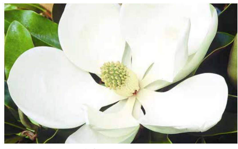
Blanchard Southern Magnolia flower

The tree's structure is usually central leader dominant with well-spaced major branching that yields a loose pyramidal form. The growth habit is adaptable to be grown full to the ground, or with a clear trunk when visibility is desired.