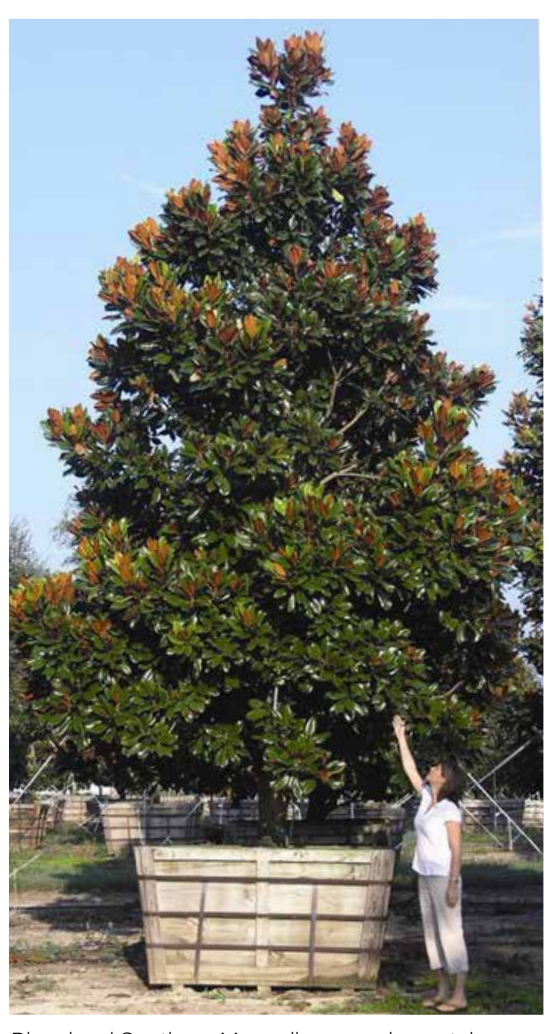
Blanchard Southern Magnolia grown in container

Dressed with dynamic foliage that illuminates the landscape, the Blanchard Southern Magnolia is an irresistible choice throughout southern landscapes.