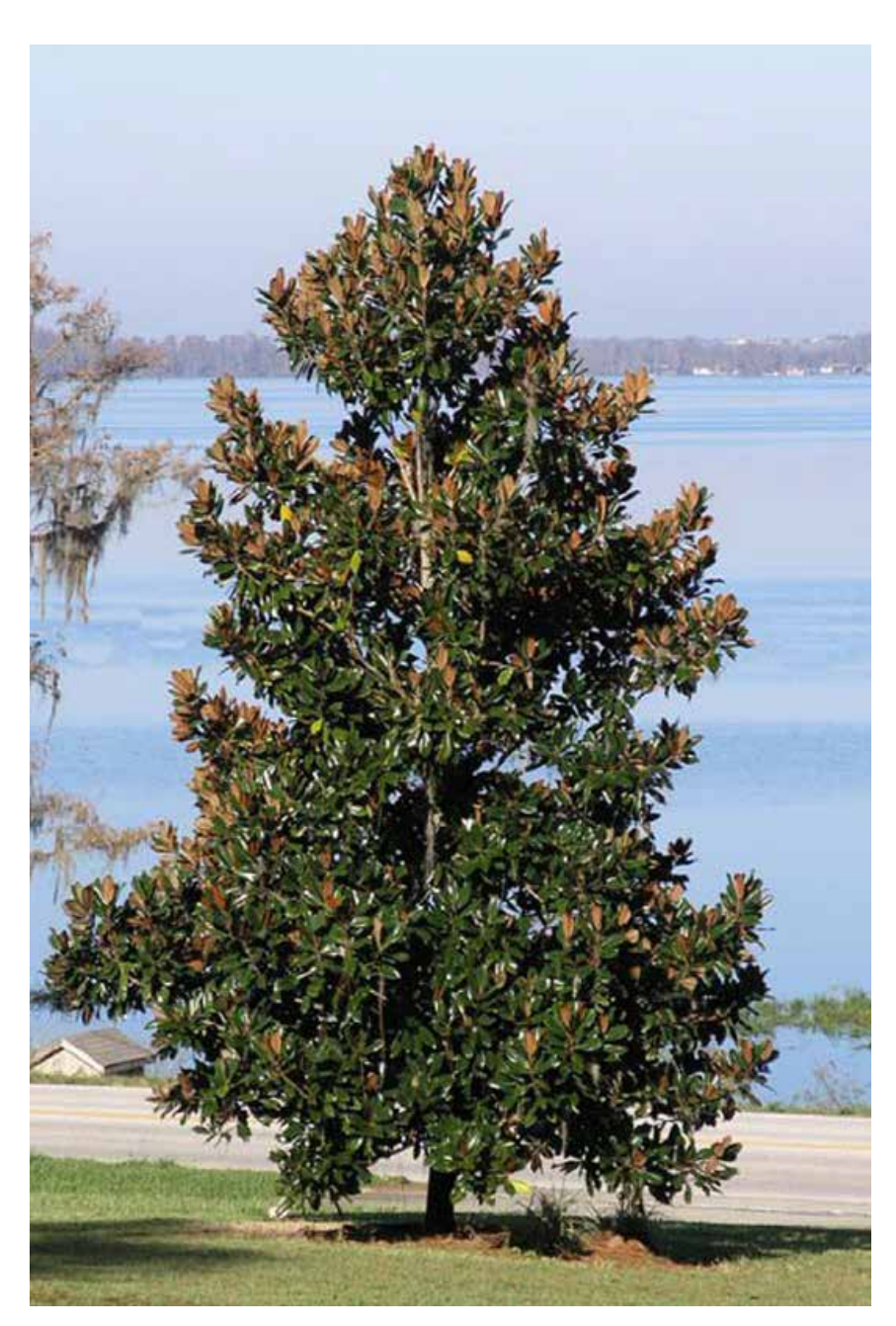
Blanchard Magnolia in the landscape