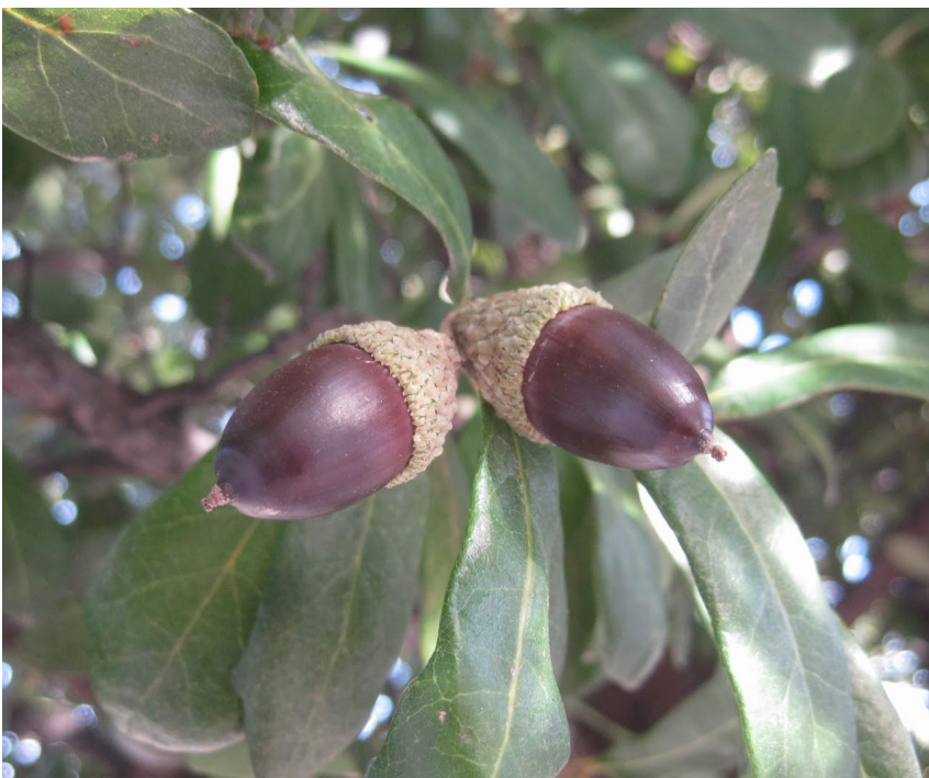
Seedling Live Oak acorns