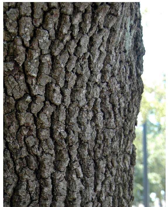
Seedling Live Oak bark