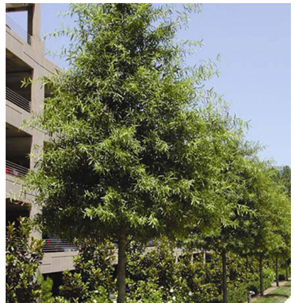
Oak Seedling Willow in the landscape