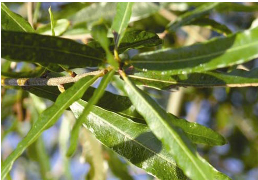
Oak Seedling Willow Leaves

Willow Oaks are often used as sources of shade in most landscapes. They are mostly used as ornamental trees due to their size and beauty throughout the seasons. They are mostly found in the southern states of the United States. You can also find them commonly planted in malls, along roads, and in residential neighborhoods. If planted close to sidewalks, please keep in mind that ample growing room is necessary, as the roots of this tree can crack sidewalks if the tree grows larger than expected.