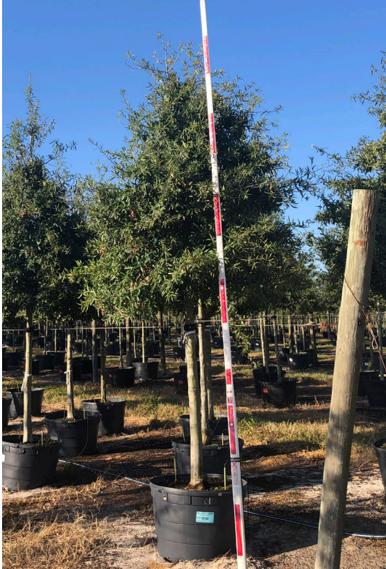
Container grown Oak Seedling Willow

The Quercus phellos , commonly known as the Willow Oak, is a tall majestic tree, capable of reaching over 70' in height and over 50' in width. The Willow Oak is one of the most popular trees for horticultural planting because of the shade it provides and its appealing shape.